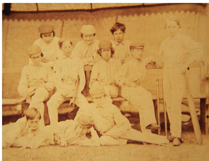
1858 1ST XI