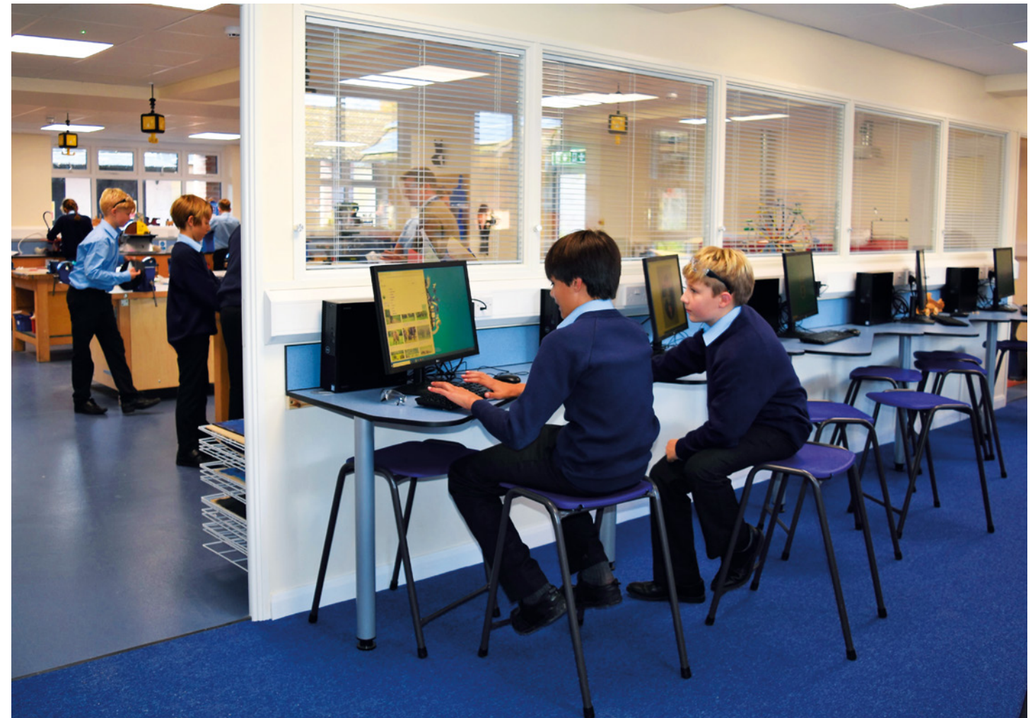
THE IT SUITE AND THE DT WORKSHOP BEYOND