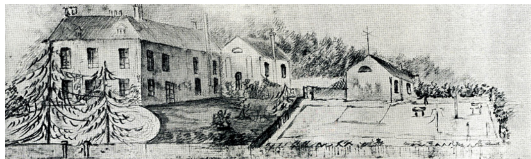
1830 SKETCH OF TWYFORD SCHOOL