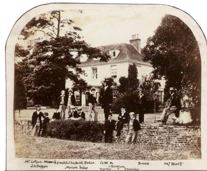
TWYFORD SCHOOL HOUSE AND BOYS

In another diary entry Dodgson notes 'I like very much the system of freedom and intimacy which prevails here between masters and the boys; though there must often be a risk of the boys passing over the bounds of the respect due to their masters. It is quite the system of ruling by love, and with a master like Kitchin seems to answer well, but I should doubt if there are