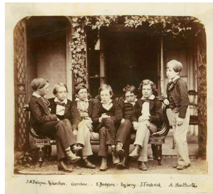
GROUP OF SEVEN BOYS