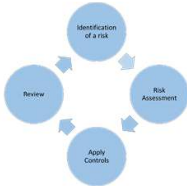
Figure 2 – Risk Assessment Cycle